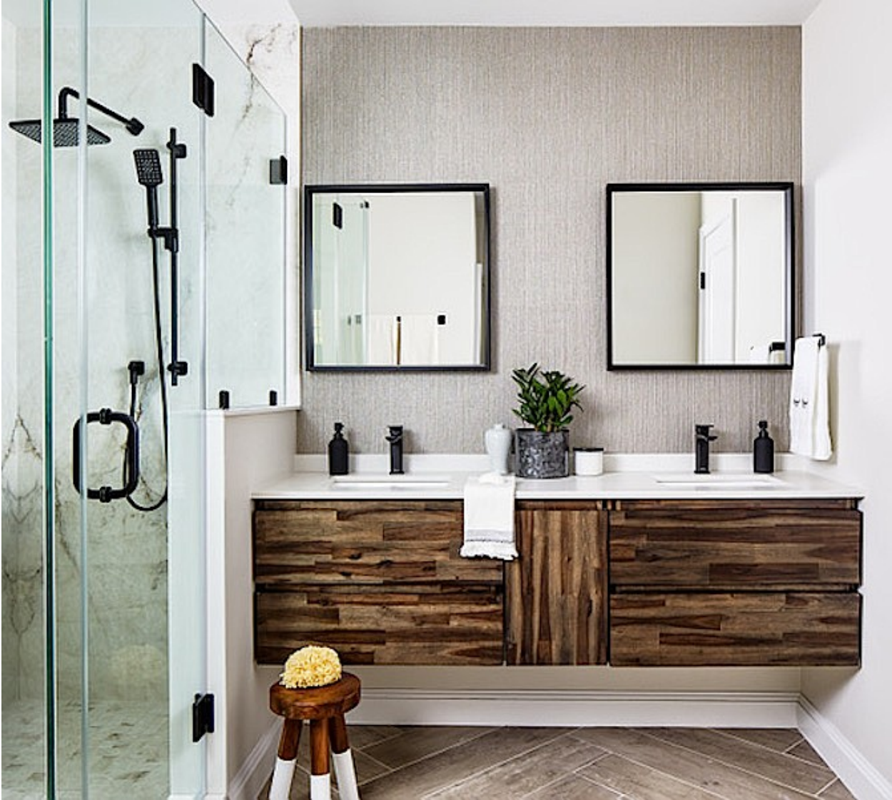
White countertop, dark wood cabinets, floating vanity, black fixtures create a spa-like atmosphere in this bathroom by InSite Builders & Remodeling.